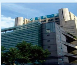
AFFILIATED THE FIRST HOSPITAL "the most beautiful and splendid city in the world".

Founded in 1897 as one of the earliest institutions of higher learning in China, Zhejiang University is now a leading research university under the direct administration of China's Ministry of Education. Reputed as the 'East Cambridge' in history, Zhejiang University has always been ranked among the top universities in China in terms of its academic strength shown in teaching, research and social service.