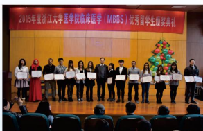
AWARDING SCHOLARSHIP CEREMONY