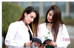
SISTERS IN ZSUM